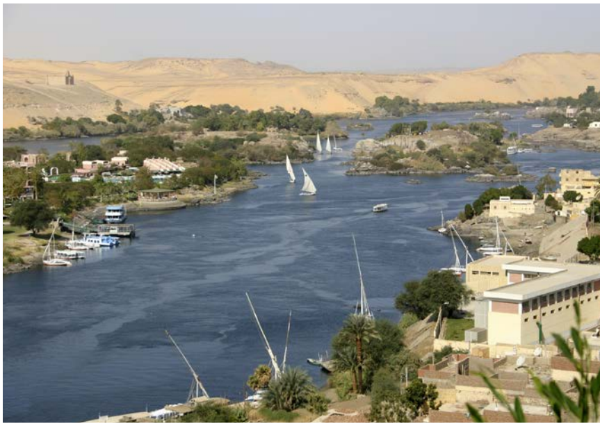
The Nile runs through most of Egypt's cities and towns, including Aswan, shown here.

The fertile Nile River Valley lies between the Western and Eastern deserts. The Nile is the longest river in the world. It flows from south to north and ends at the Mediterranean Sea. Near its mouth, the river spreads out into smaller rivers, forming a triangle of fertile land. This area of land around the river's mouth is the Nile Delta. It is some of the most fertile land in Egypt. The Nile Delta stretches for about 160 kilometers (100 mi.) between Cairo and the Mediterranean Sea.