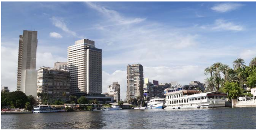
Western-style hotels and other modern buildings line the banks of the Nile in Cairo.

Cairo (KEYE-roh), the capital of Egypt, is located in the north, along the Nile River. It is one of the largest cities in Africa. Cairo sits on the same site as it did one thousand years ago. More than eleven million people live there today.