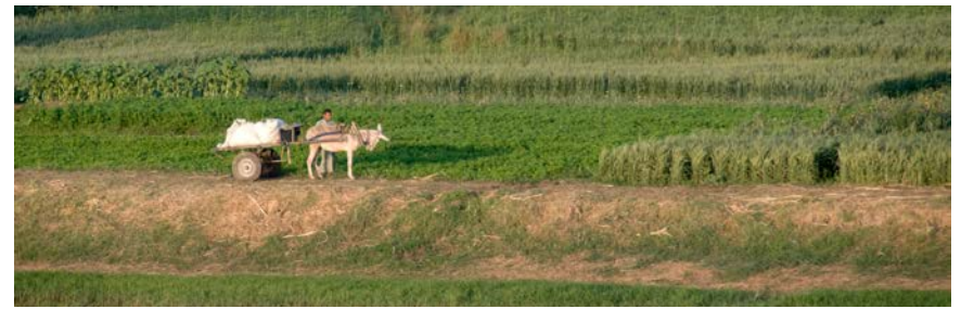
Many farmers along the Nile use animals such as donkeys to help them carry crops and supplies.

In older areas, the streets are narrow and crowded. Here, people shop at covered bazaars . Tea and coffeehouses provide places for people to enjoy local refreshments.