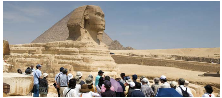
The Great Sphinx has the head of a man and the body of a lion.

In the fifteenth and sixteenth centuries, Egypt was part of the Ottoman Empire, an empire that began in Turkey. In the eighteenth century, France tried to take over Egypt. This caused the British to become involved in Egypt's government because they did not want France to gain control of Egypt. At the beginning of World War I (1914–1918), Egypt came under the control of the British Empire. Finally, in 1922, Egypt won partial independence from Britain.