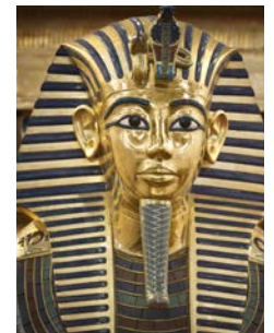
Gold mask of Tutankhamun

Another popular site is the Valley of the Kings in southern Egypt, near the city of Luxor. Some of Egypt's most famous pharaohs were buried there in more than sixty tombs. Many of the treasures from the tombs were stolen by robbers long ago. The tomb of Tutankhamun (toot-an-KAH-muhn) still had its treasures when it was discovered in 1922. Many of these amazing treasures now sit in the Egyptian Museum in Cairo. Near the Valley of the Kings are other ruins of great temples built by the pharaohs.