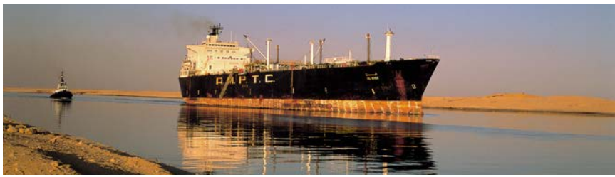
The Suez Canal in Egypt connects the Mediterranean and the Red seas. The French built the canal between 1859 and 1869.

Over the centuries, several outside forces gained control of Egypt. In 332 BC, the emperor Alexander the Great took Egypt. He founded the city of Alexandria, which still sits on the northern coast. Egypt was part of the Greek Empire for more than three hundred years.