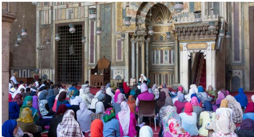
Muslims attend a sermon at a mosque in Cairo.

Most people in Egypt speak some form of Arabic. Most Egyptians are Arabs descended from people who originally lived in the Arabian Peninsula in Asia. The Arabian Peninsula is where Saudi Arabia and several other countries are now located. Many different groups of Arabs live in Egypt. The form of Arabic they speak depends on where they live. Other Egyptians are of African descent. Many of these groups have their own languages, too.