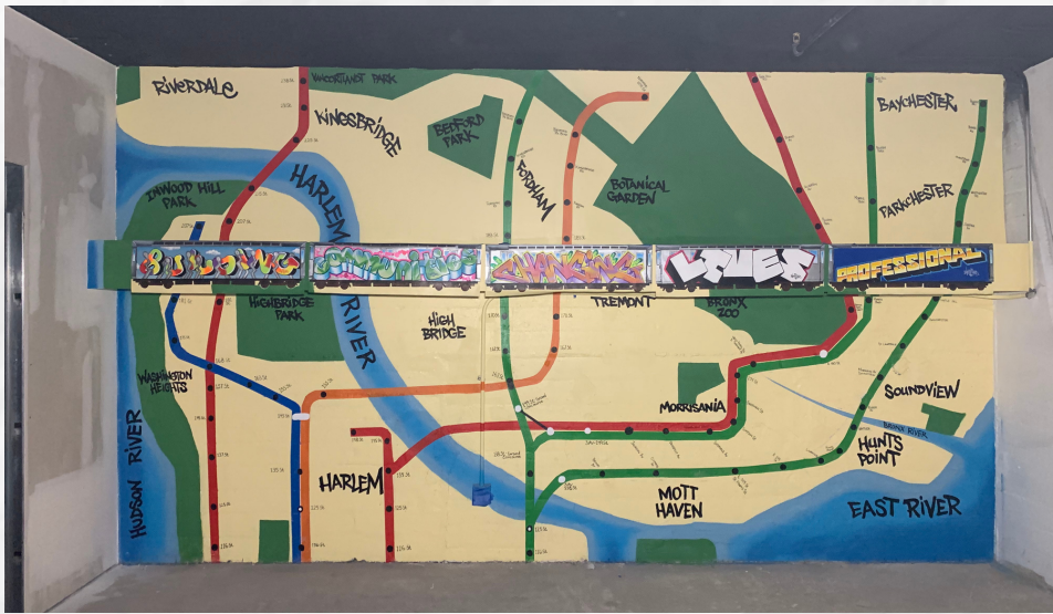
Mural commissioned by Westhab in their Bronx location