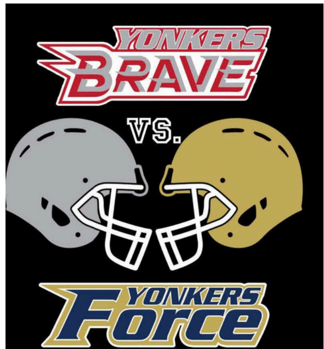
The Yonkers Brave vs. Force football game will be held at Roosevelt High School Early College Studies this Saturday at 1:30 PM