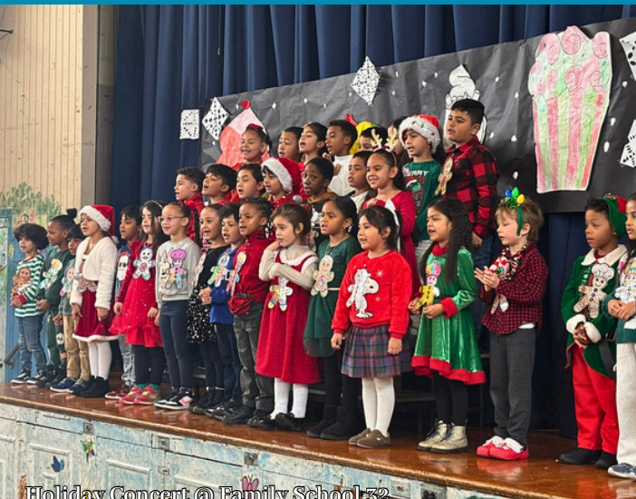
Holiday Concert @ Family School 32