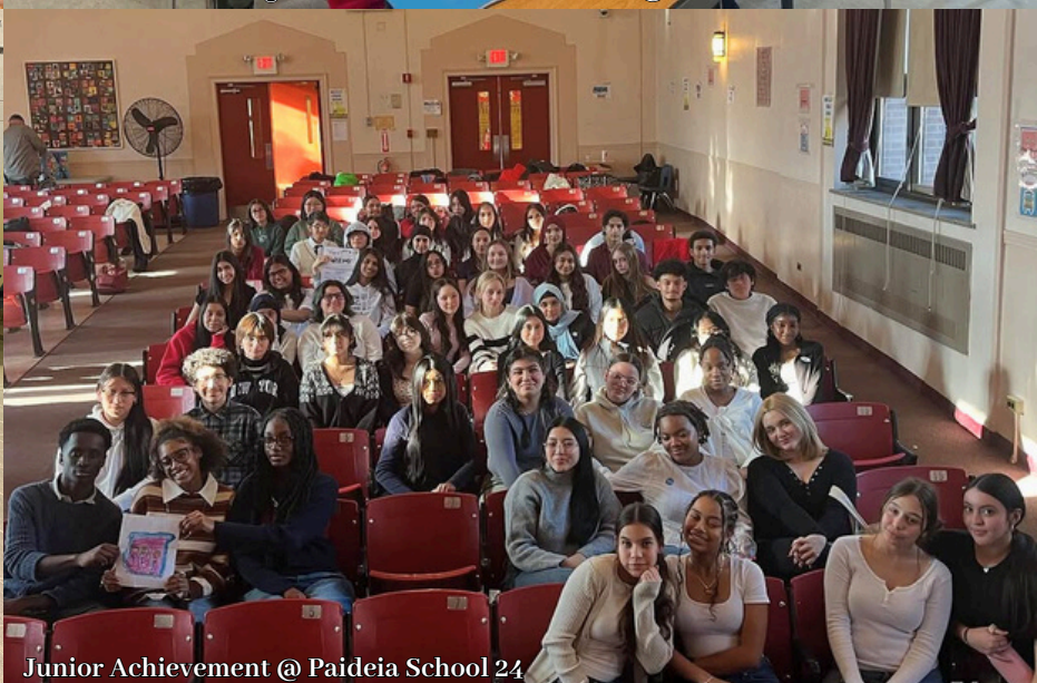
Junior Achievement @ Paideia School 24