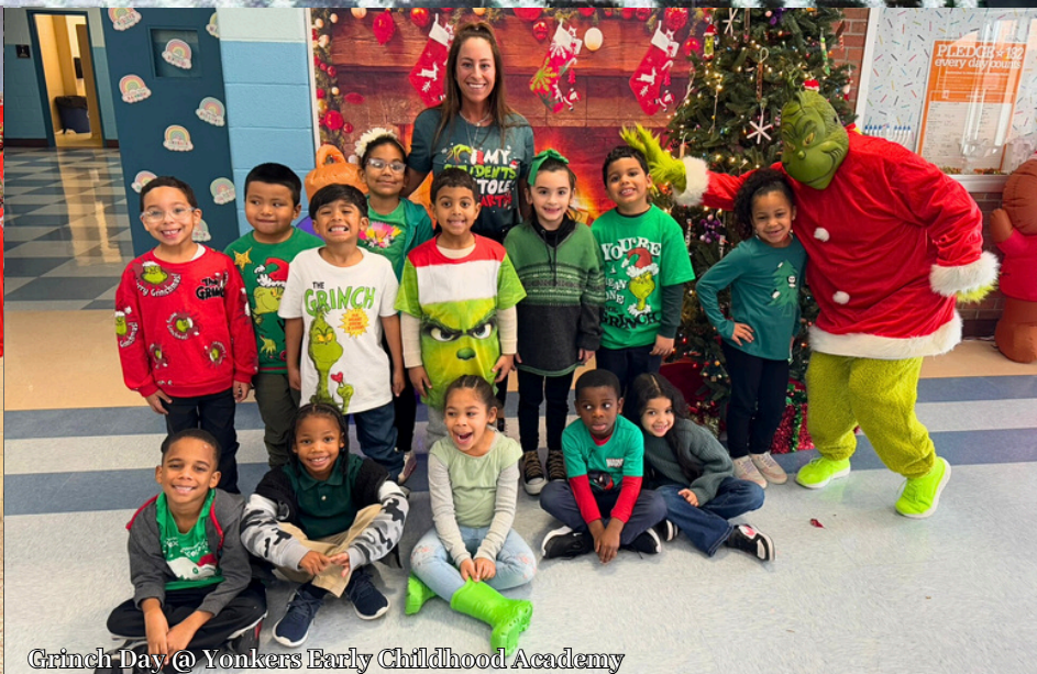
Grinch Day @ Yonkers Early Childhood Academy