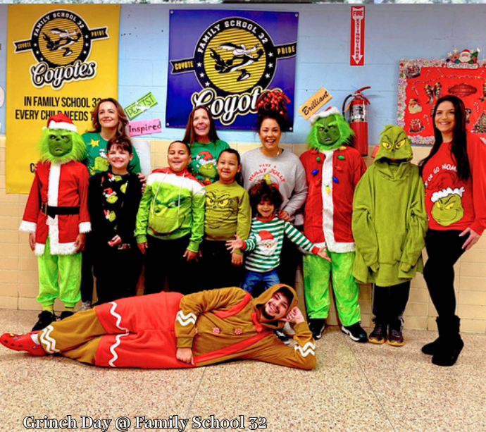
Grinch Day @ Family School 32