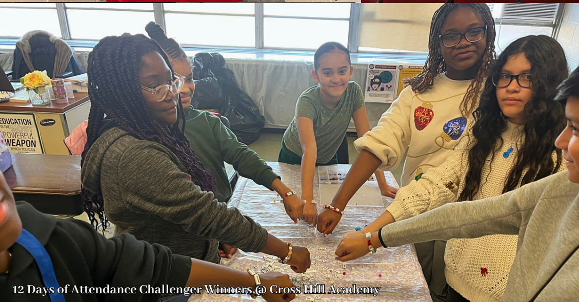
12 Days of Attendance Challenger Winners @ Cross Hill Academy