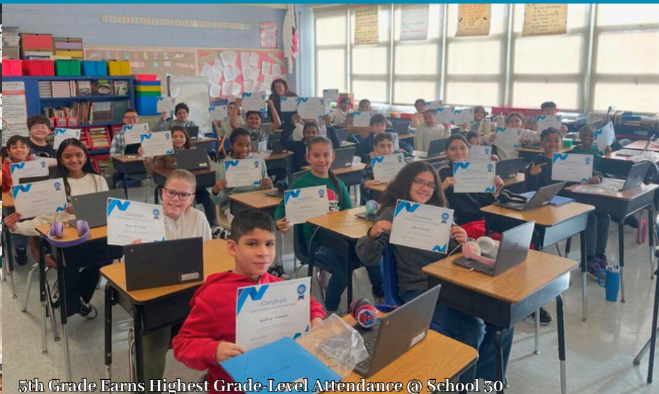
5th Grade Earns Highest Grade-Level Attendance @ School 30