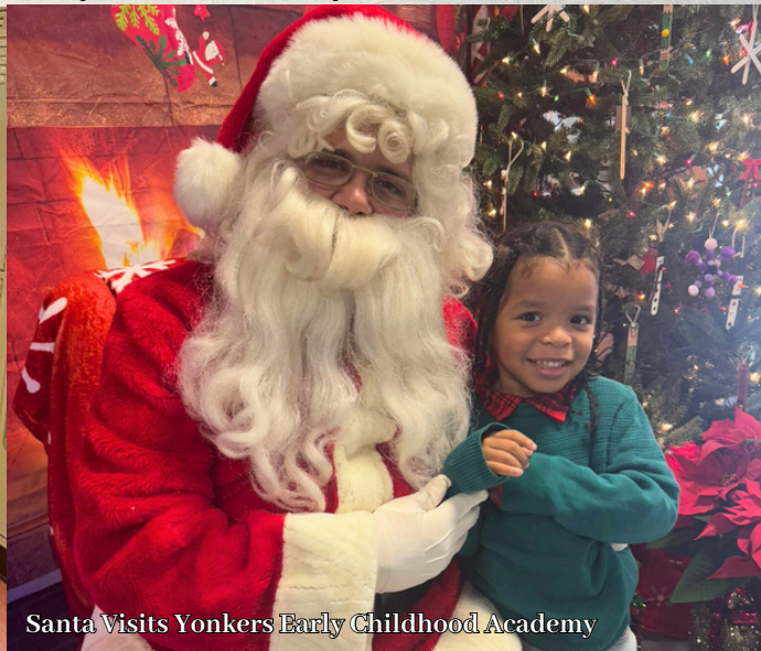
Santa Visits Yonkers Early Childhood Academy