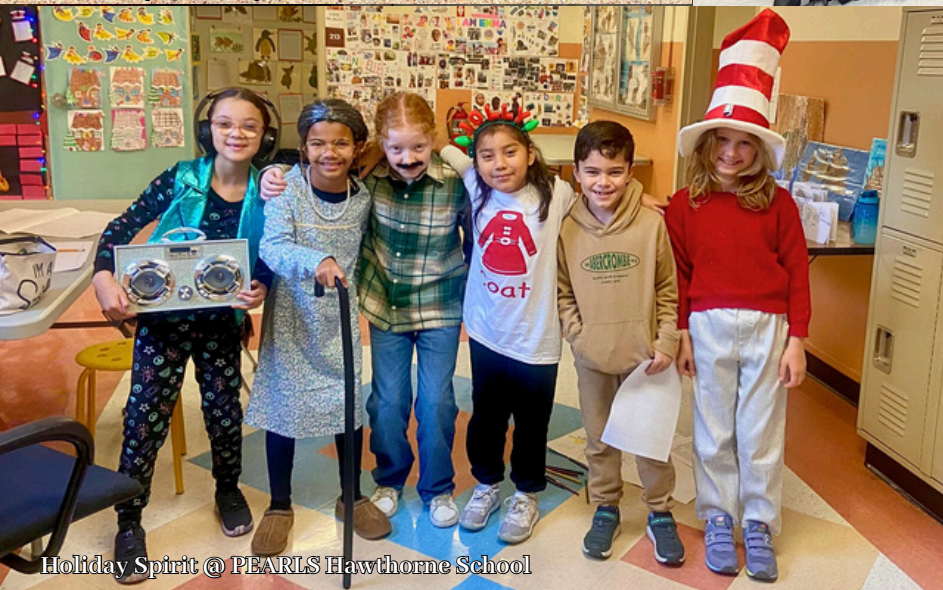
Holiday Spirit @ PEARLS Hawthorne School