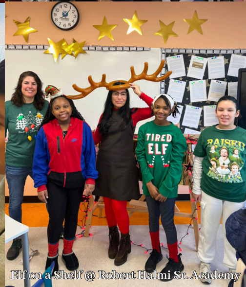
Elf on a Shelf @ Robert Halmi Sr. Academy