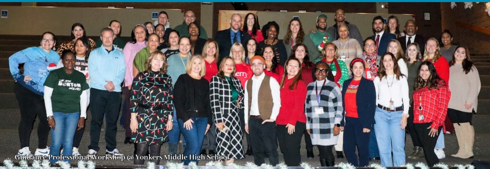
Guidance Professional Workshop @ Yonkers Middle High School