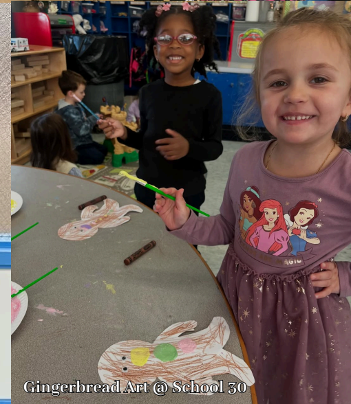
Gingerbread Art @ School 30