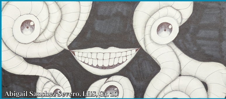
Abigail Sanchez-Severo, LHS, Gr. 10