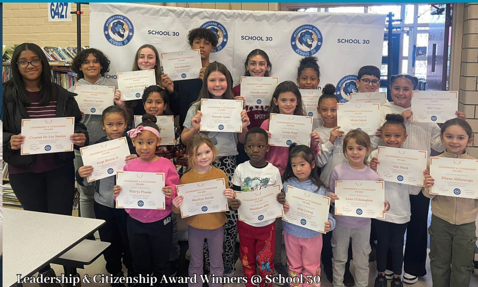
Leadership & Citizenship Award Winners @ School 30