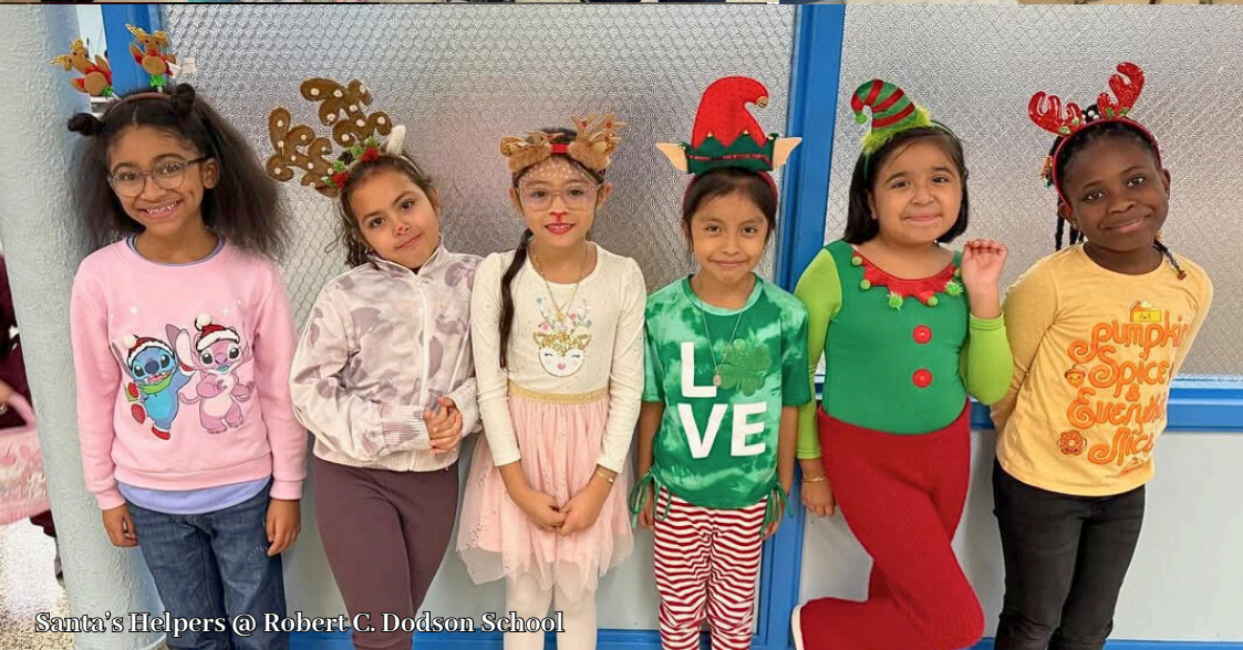
Santa's Helpers @ Robert C. Dodson School