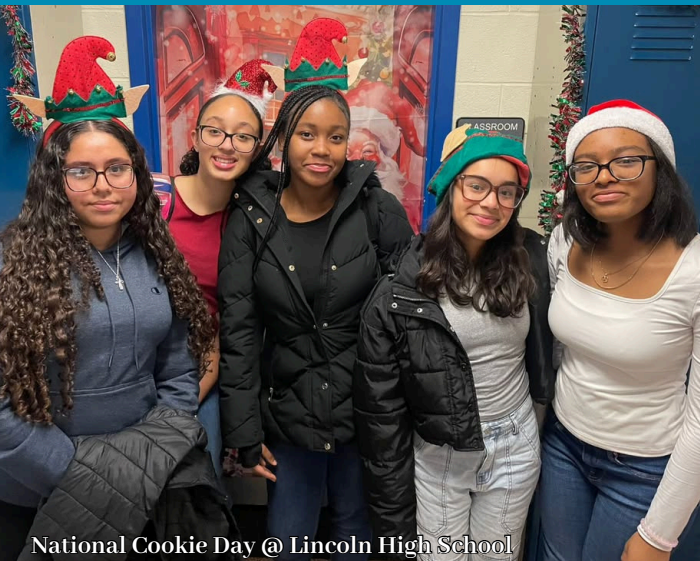
National Cookie Day @ Lincoln High School