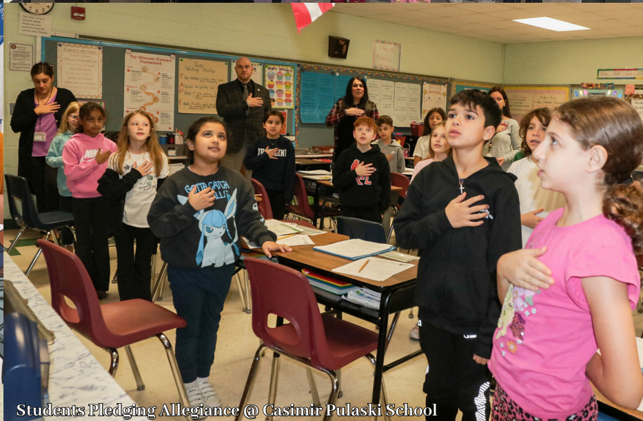
Students Pledging Allegiance @ Casimir Pulaski School