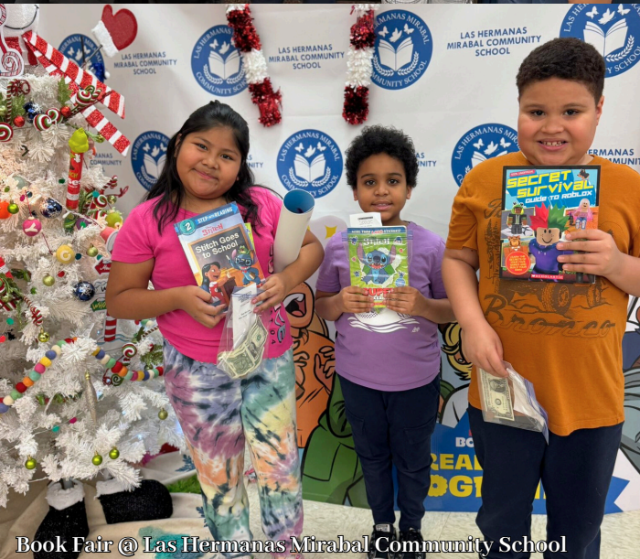
Book Fair @ Las Hermanas Mirabal Community School