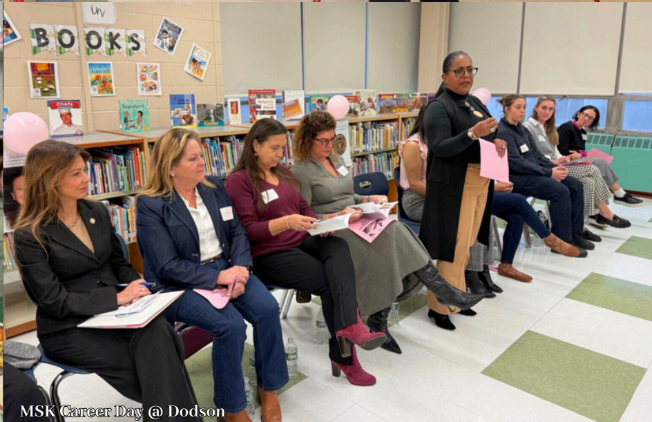
MSK Career Day @ Dodson