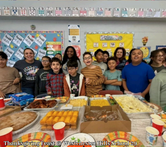
Thanksgiving Feast @ Westchester Hills School 29