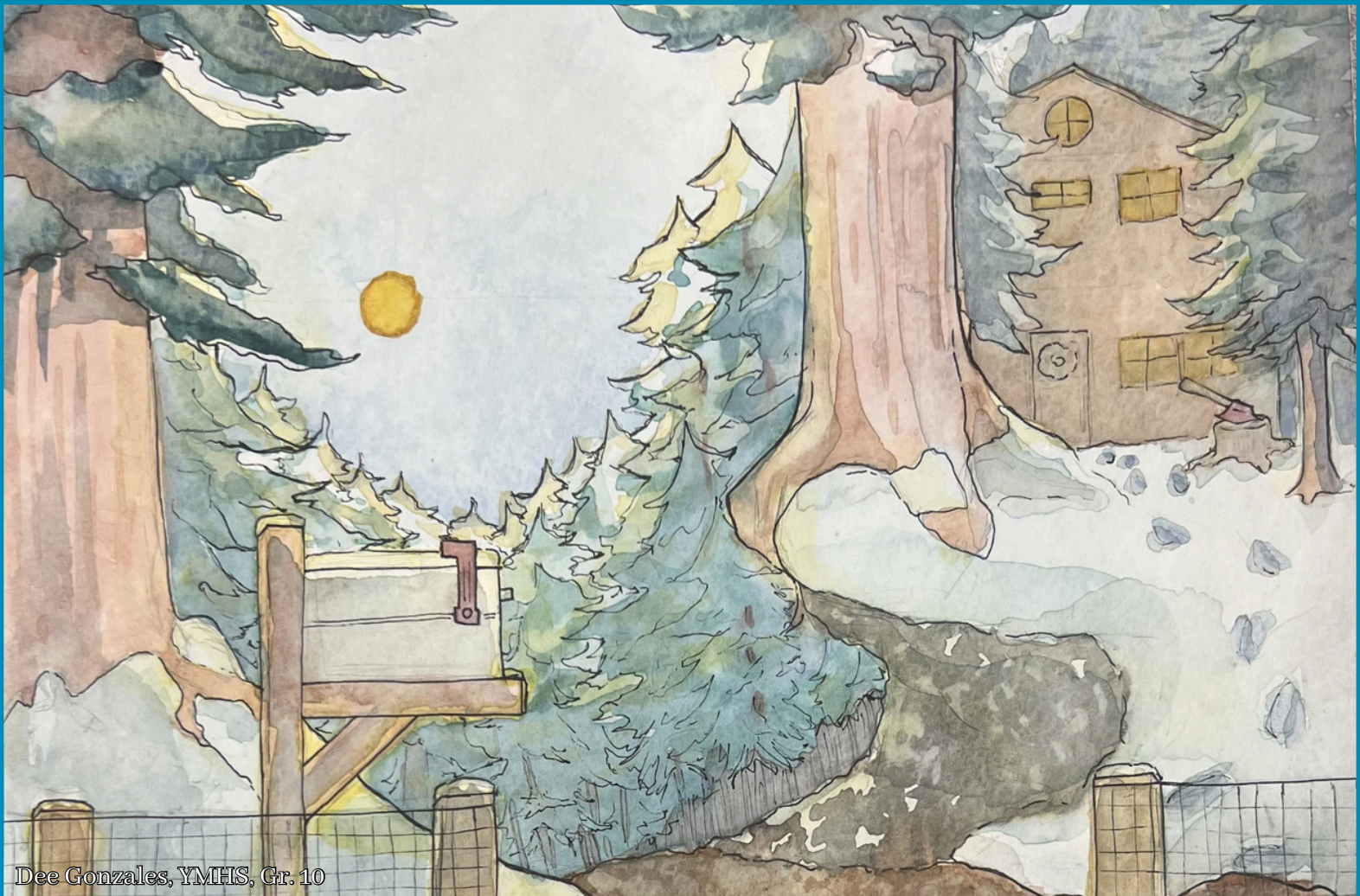
Dee Gonzales, YMHS, Gr. 10