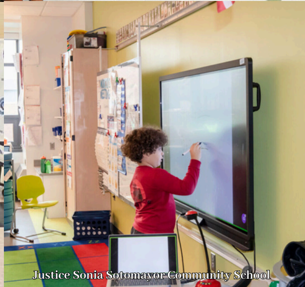
Justice Sonia Sotomayor Community School