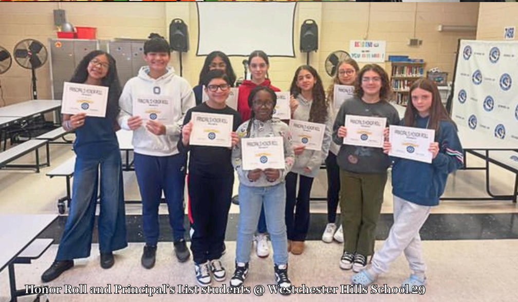
Honor Roll and Principal's List students @ Westchester Hills School 29