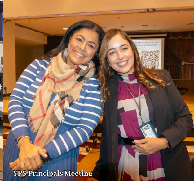
YPS Principals Meeting