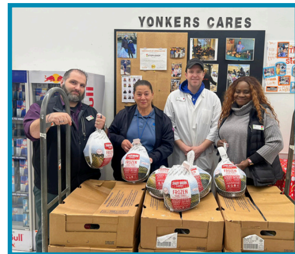
Thanksgiving Turkey Giveaway at Las Hermanas Mirabal Community School