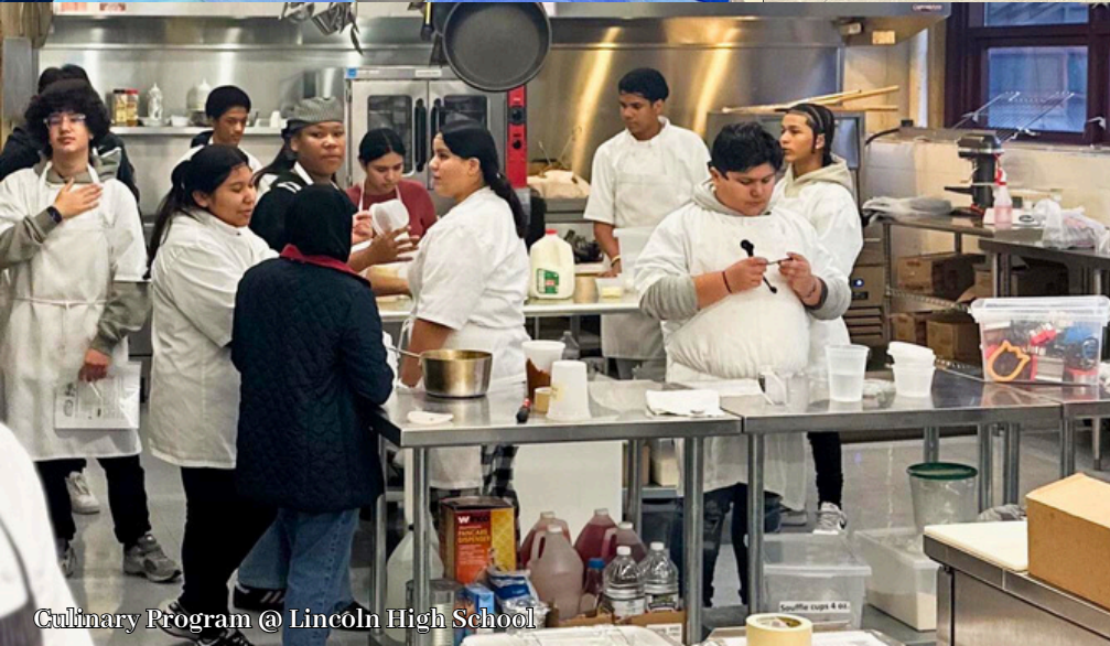
Culinary Program @ Lincoln High School