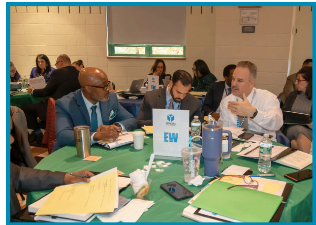
Principals Engaged in Thoughtful Discussion During this Week's Principals Meeting, Exchanging Ideas & Strategies to Support School Success

This week has been an incredible mix of innovation, recognition, and collaboration as we continue building opportunities for our students and supporting our community. From groundbreaking initiatives to celebrating student achievements, there is so much to share with you.