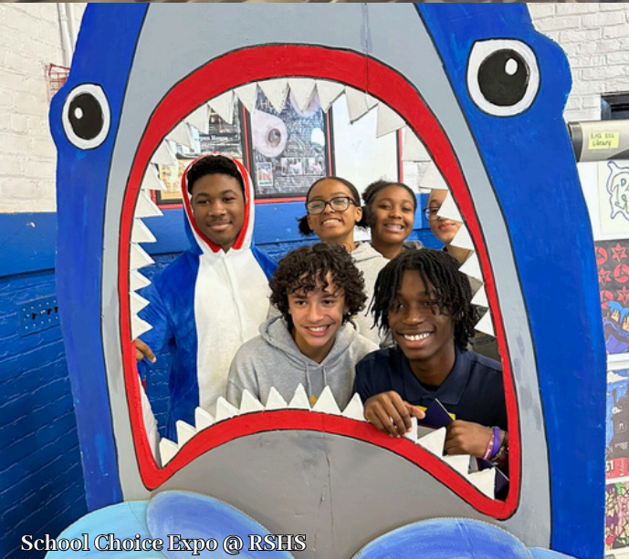
School Choice Expo @ RSHS