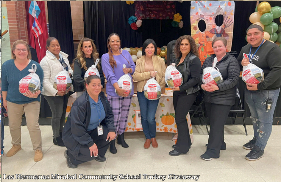
Las Hermanas Mirabal Community School Turkey Giveaway