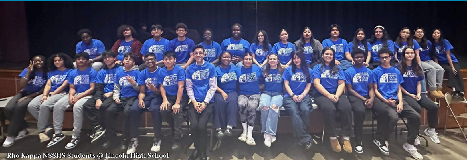
Rho Kappa NSSHS Students @ Lincoln High School