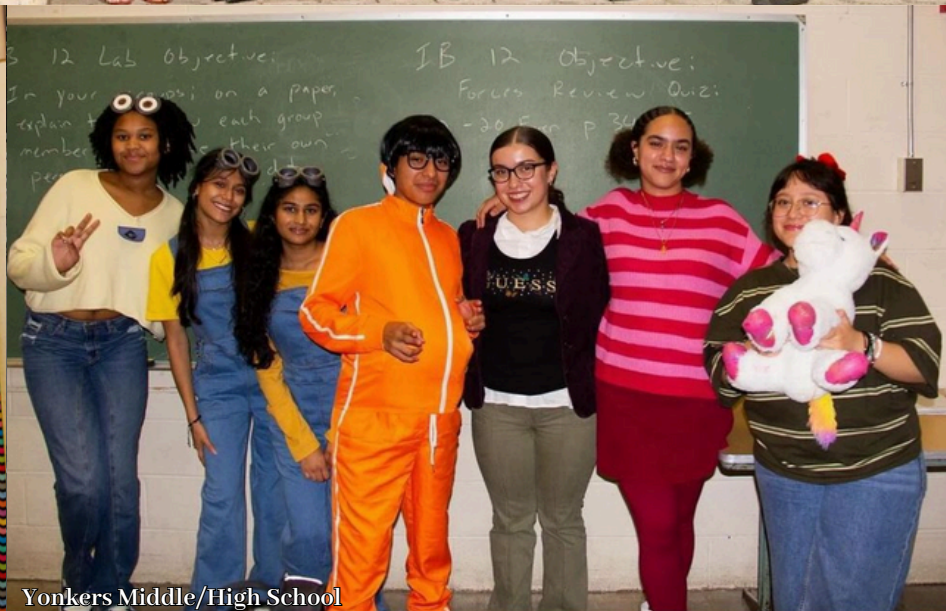
Yonkers Middle/High School