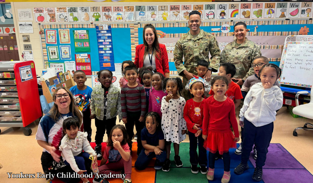
Yonkers Early Childhood Academy