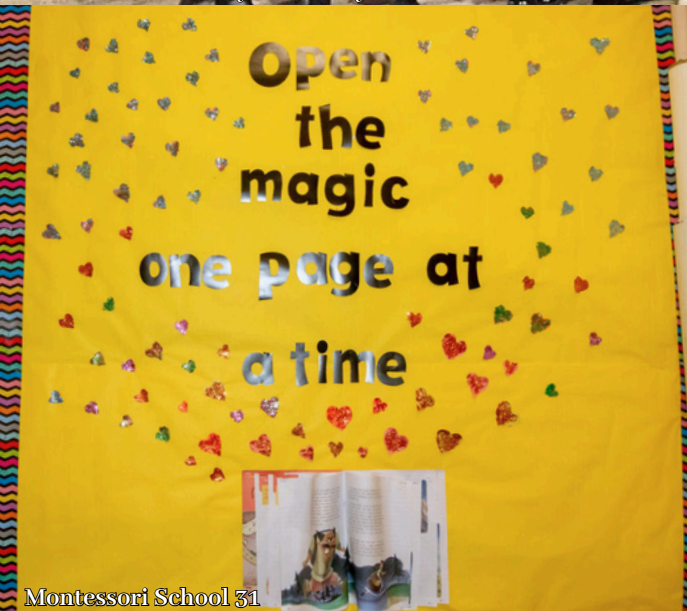
Montessori School 31