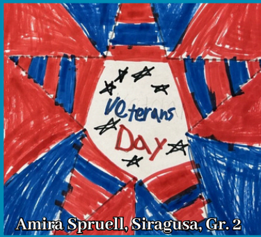
Amira Spruell, Siragusa, Gr. 2