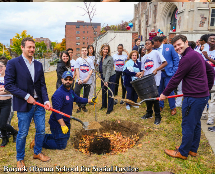
Barack Obama School for Social Justice