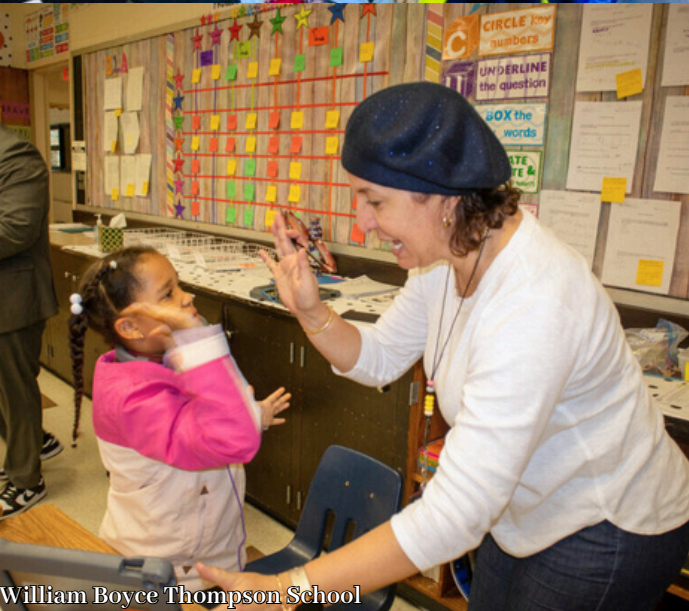
William Boyce Thompson School