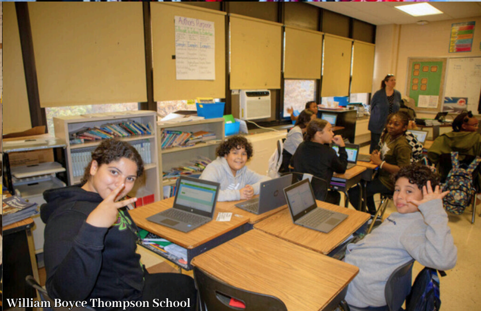
William Boyce Thompson School