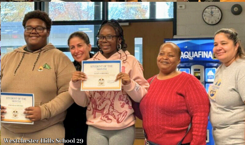
Westchester Hills School 29