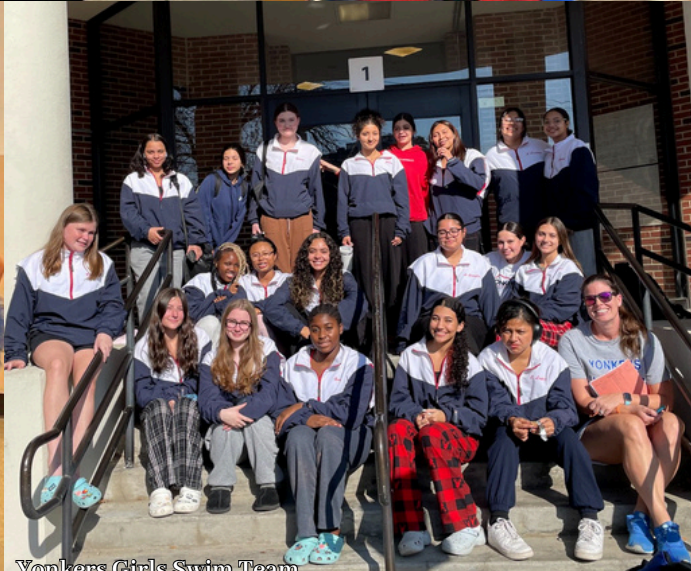
Yonkers Girls Swim Team