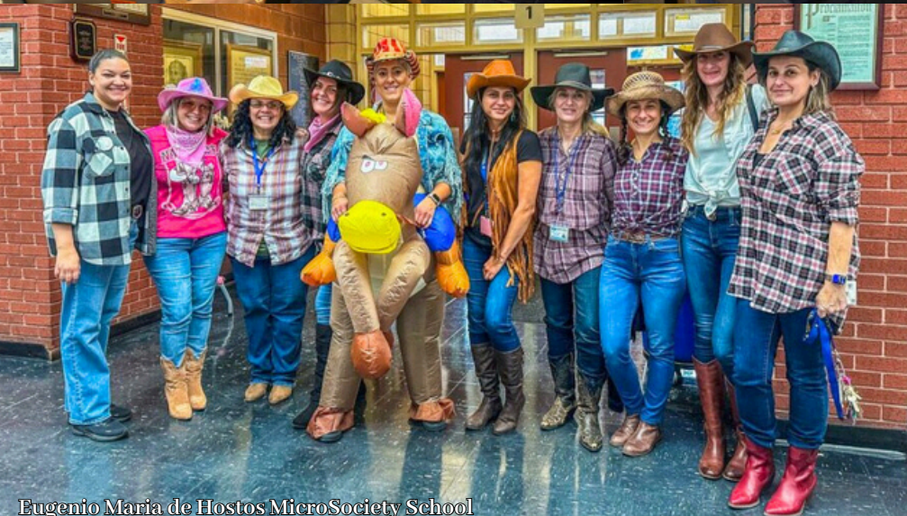
Eugenio Maria de Hostos MicroSociety School