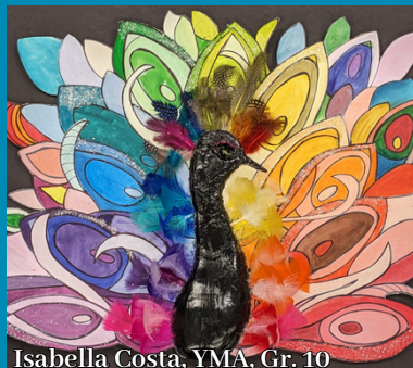
Isabella Costa, YMA, Gr. 10