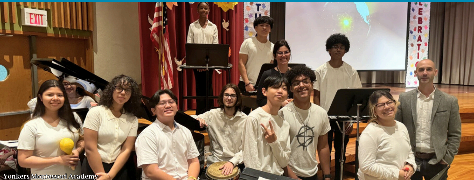
Yonkers Montessori Academy