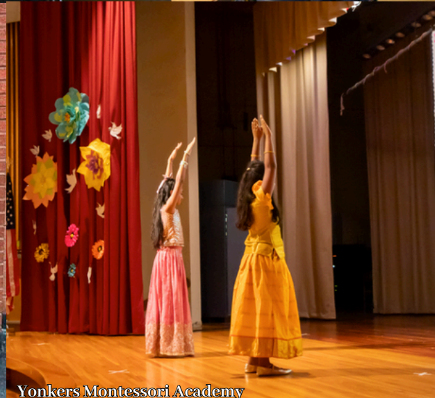
Yonkers Montessori Academy