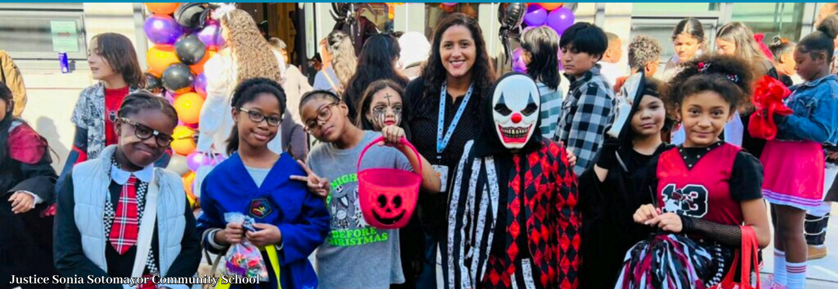
Justice Sonia Sotomayor Community School