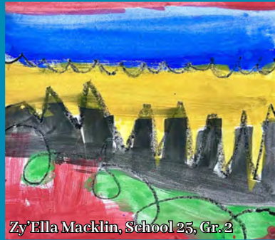
Zy'Elia Macklin, School 25, Gr. 2