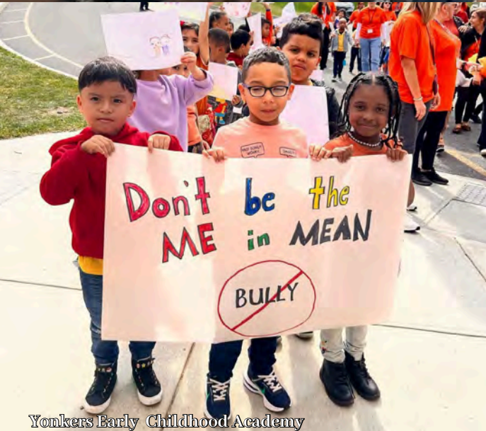
Yonkers Early Childhood Academy