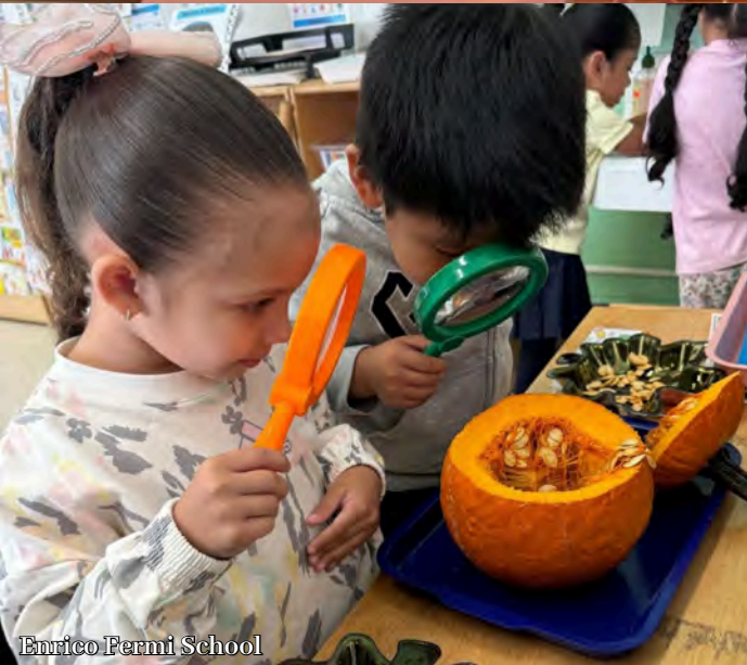
Enrico Fermi School