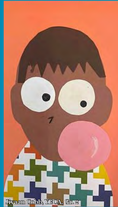
Jiyaan Gobb, YEGA, Gr. 2