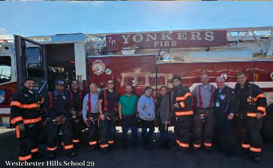
Westchester Hills School 29