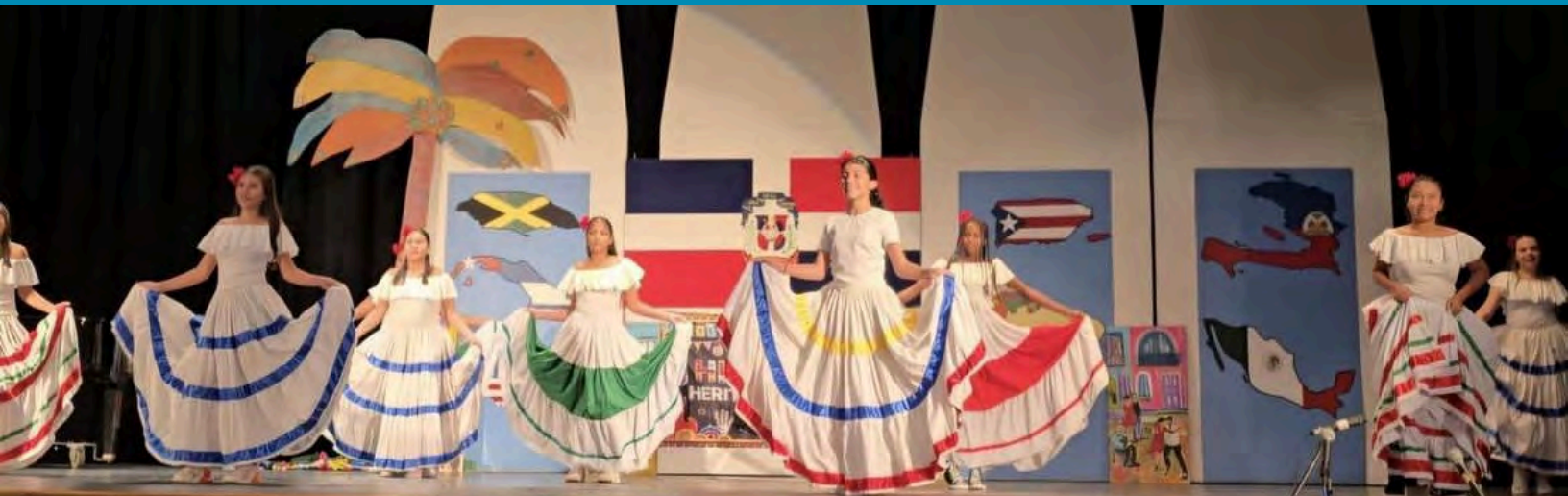
Hispanic Heritage Celebration