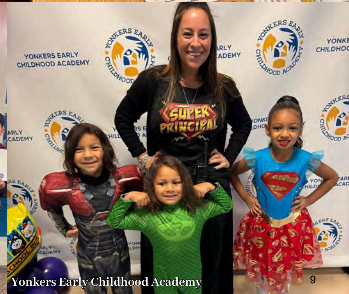
Yonkers Early Childhood Academy