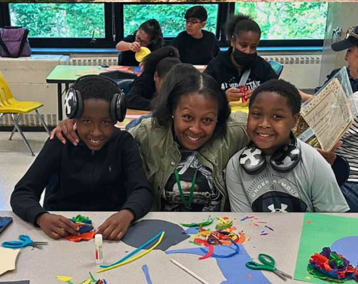
Bring Your Child to Work Day @ Boyce Thompson School