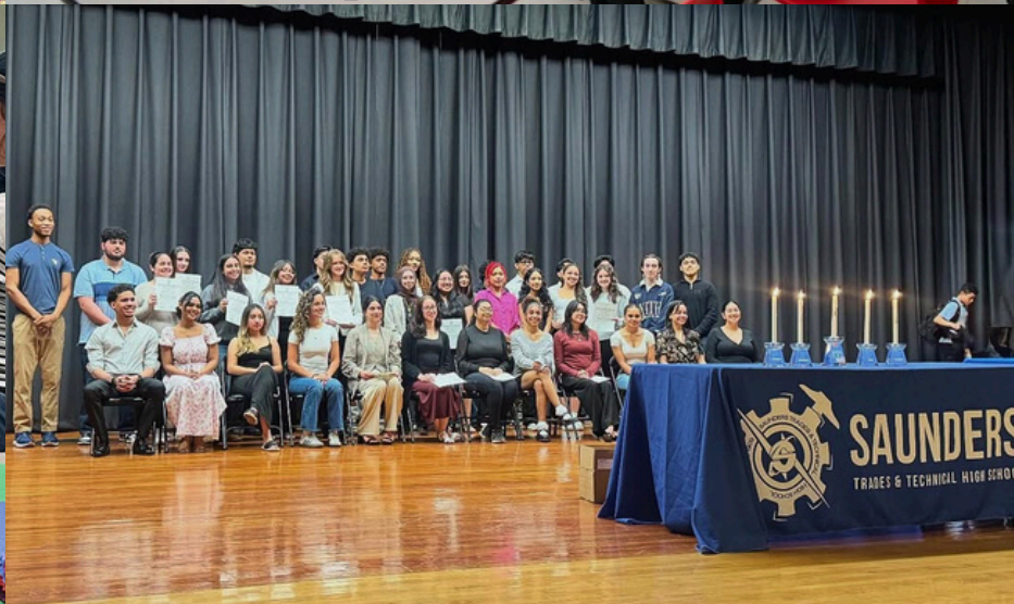
Celebrating National Honor Society Inductees @ Saunders High School