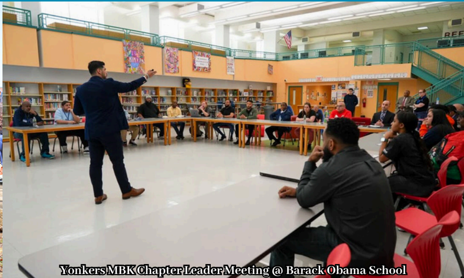
Yonkers MBK Chapter Leader Meeting @ Barack Obama School