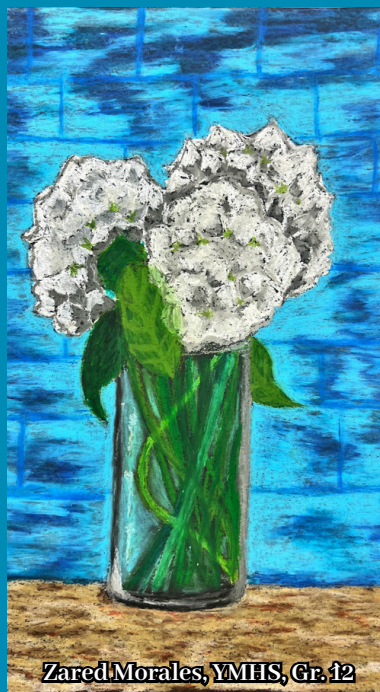
Zared Morales, YMHS, Gr. 12