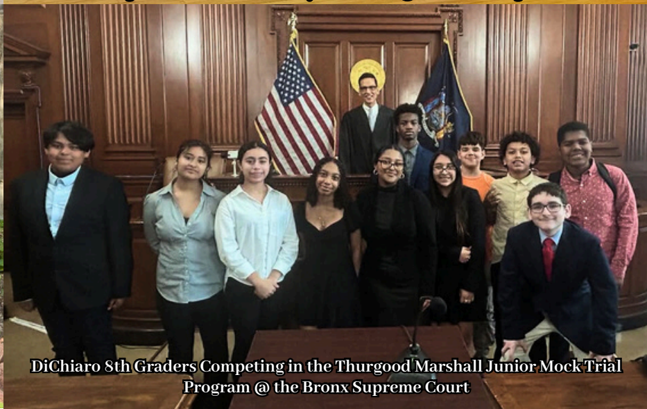
DiChiaro 8th Graders Competing in the Thurgood Marshall Junior Mock Trial Program @ the Bronx Supreme Court