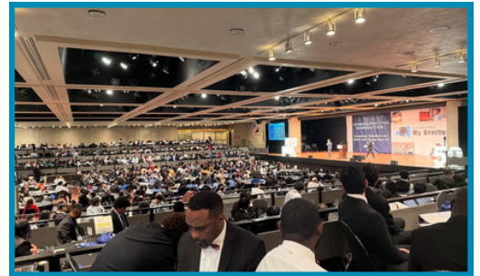
MBK Yonkers Attends the Annual NYS MBK Symposium in Albany for the Induction of the 2025 MBK Fellows