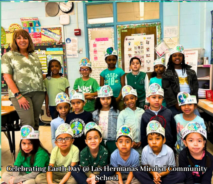
Celebrating Earth Day @ Las Hermanas Mirabal Community School