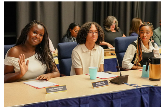
Board of Education Student Trustees Participated in their First Meeting this Week

The Spring season is in full bloom with the nicer weather approaching I hope you take a break from the daily throws life brings and enjoy it with your families. Coming back from Spring Recess, I was reminded of what public education is all about – raising voices, celebrating progress, and standing together in support of something bigger than ourselves.