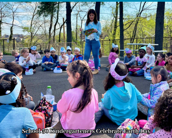
School 30 Kindergarteners Celebrate Earth Day