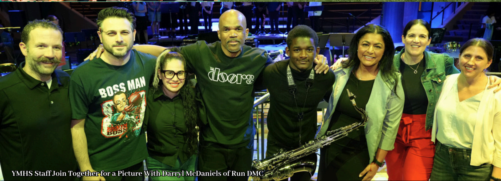
YMHS Staff Join Together for a Picture With Darryl McDaniels of Run DMC