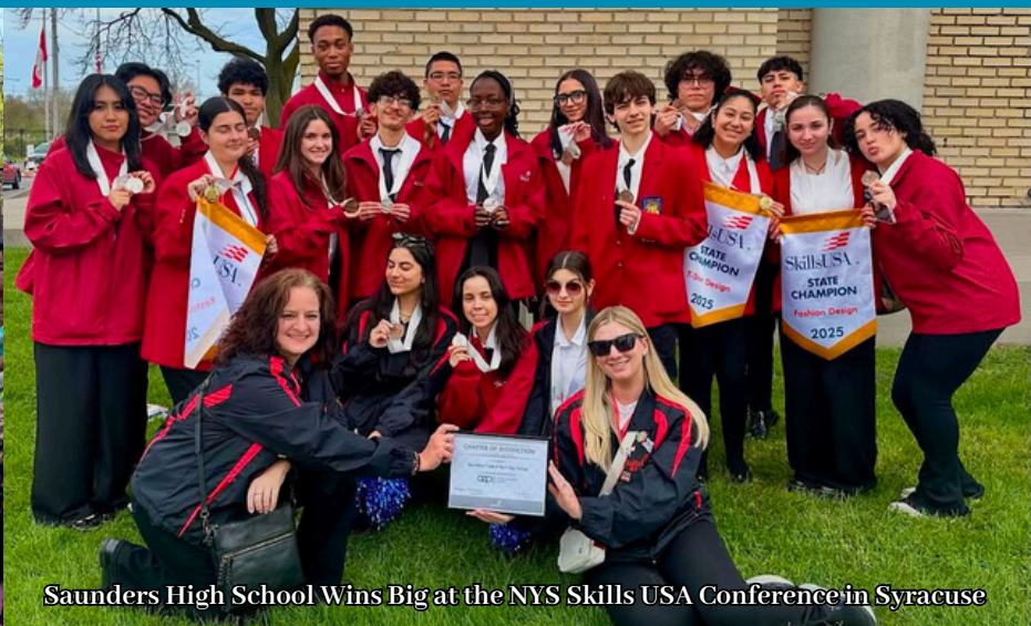
Saunders High School Wins Big at the NYS Skills USA Conference in Syracuse