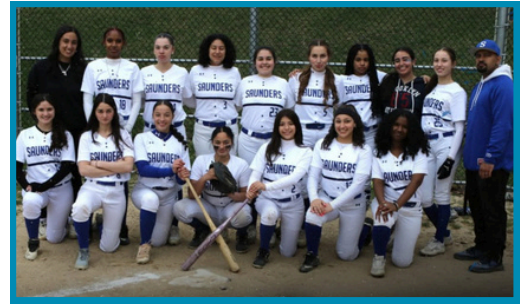
The Saunders Softball Team Kicks Off The Season Strong with a 4-1 Record. Let's Go Blue Devils!