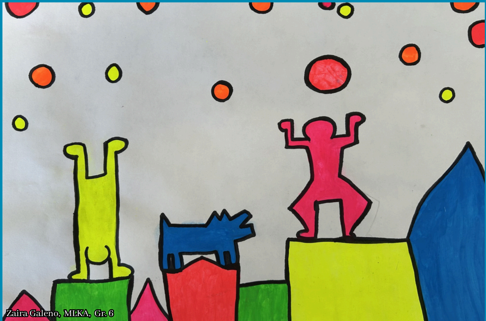
Zaira Galeno, MLKA, Gr. 6