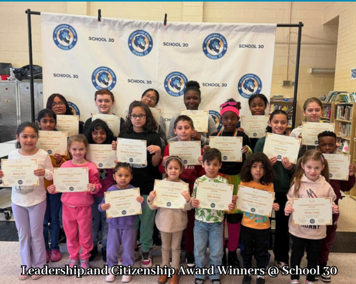
Leadership and Citizenship Award Winners @ School 30