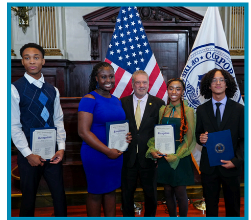
History Was Made this Week With the First-Ever Induction of Student Trustees to the Board of Education

This week, I joined the Board of Education for two committee meetings: Budget, Finance and Facilities, and the Policy and Instructional Affairs where we discussed key items for student success.