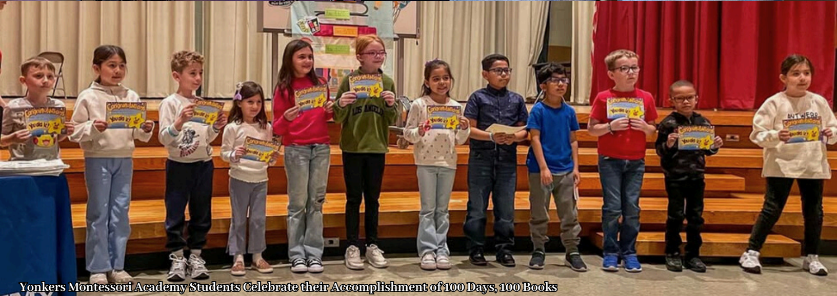
Yonkers Montessori Academy Students Celebrate their Accomplishment of 100 Days, 100 Books