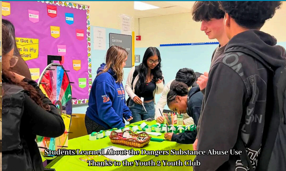
Students Learned About the Dangers Substance Abuse Use Thanks to the Youth 2 Youth Club