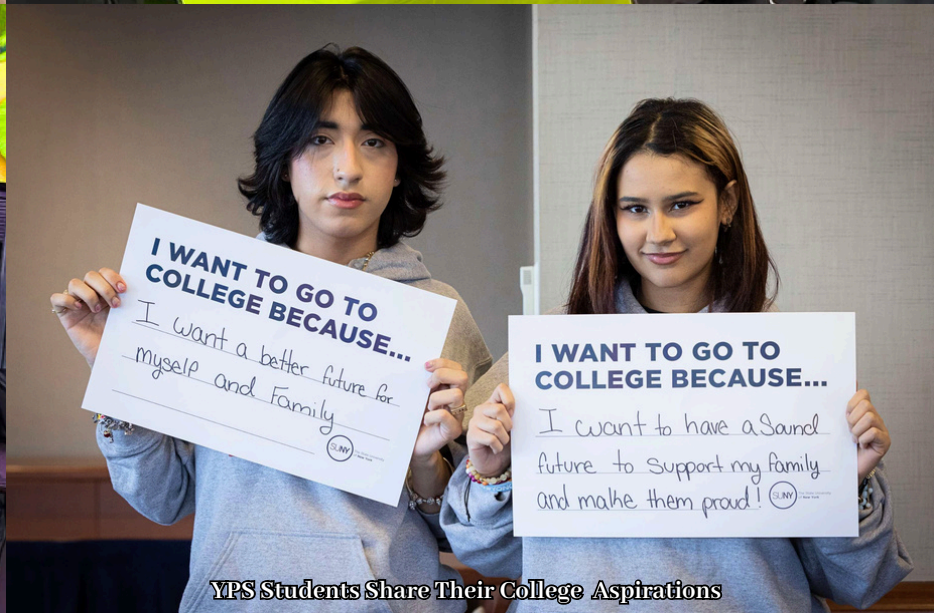
YPS Students Share Their College Aspirations