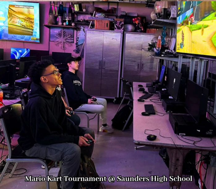
Mario Kart Tournament @ Saunders High School