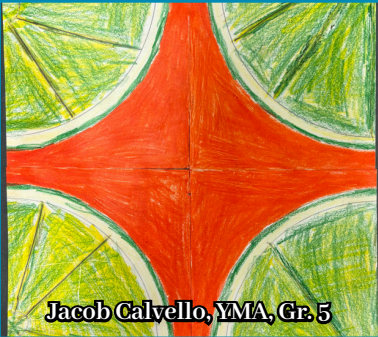
Jacob Calvello, YMA, Gr. 5