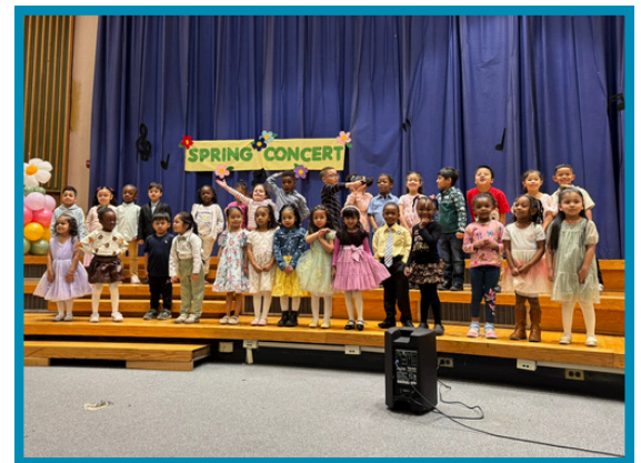
YECA Students Performing at Their Annual Spring Concert