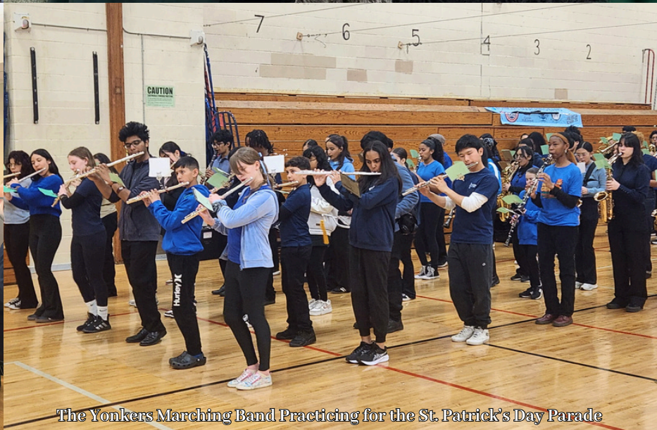
The Yonkers Marching Band Practicing for the St. Patrick's Day Parade