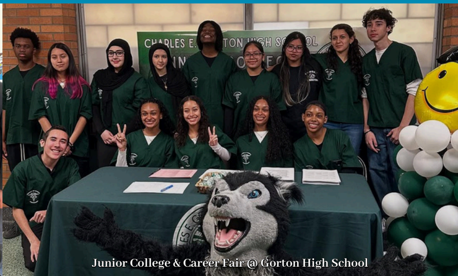
Junior College & Career Fair @ Corton High School