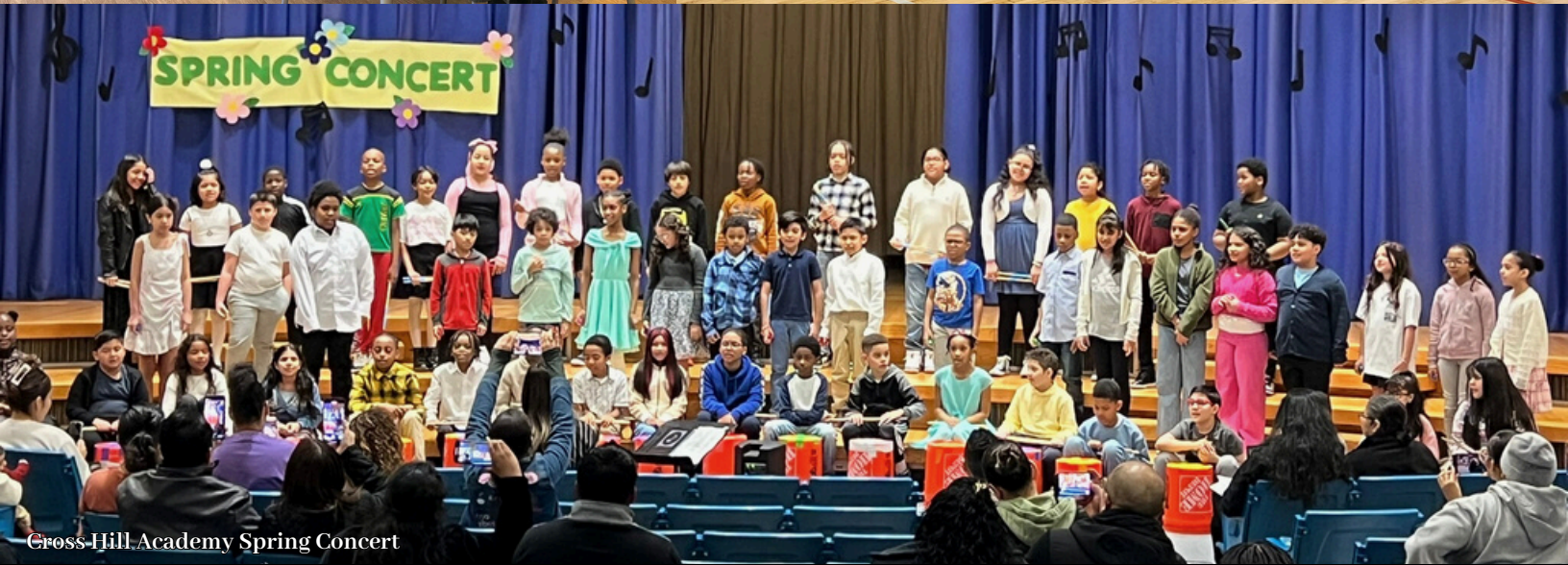
Cross-Hill Academy Spring Concert