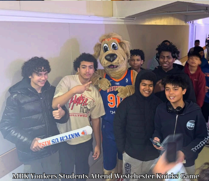
MBK Yonkers Students Attend Westchester Knicks Game