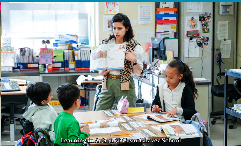
Learning in Action @ Cesar Chavez School