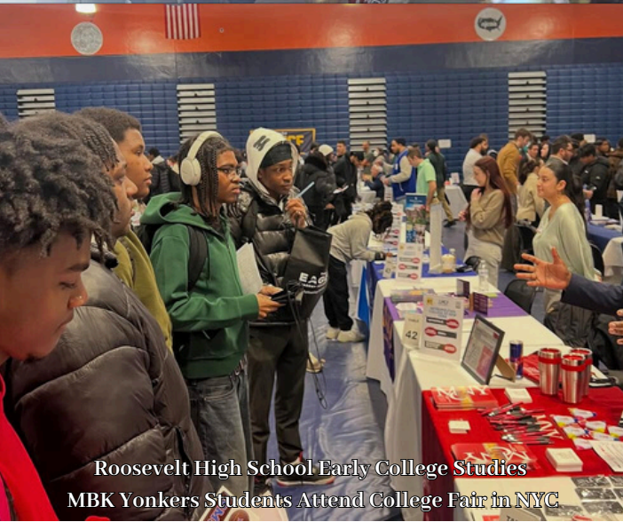
Roosevelt High School Early College Studies MBK Yonkers Students Attend College Fair in NYC