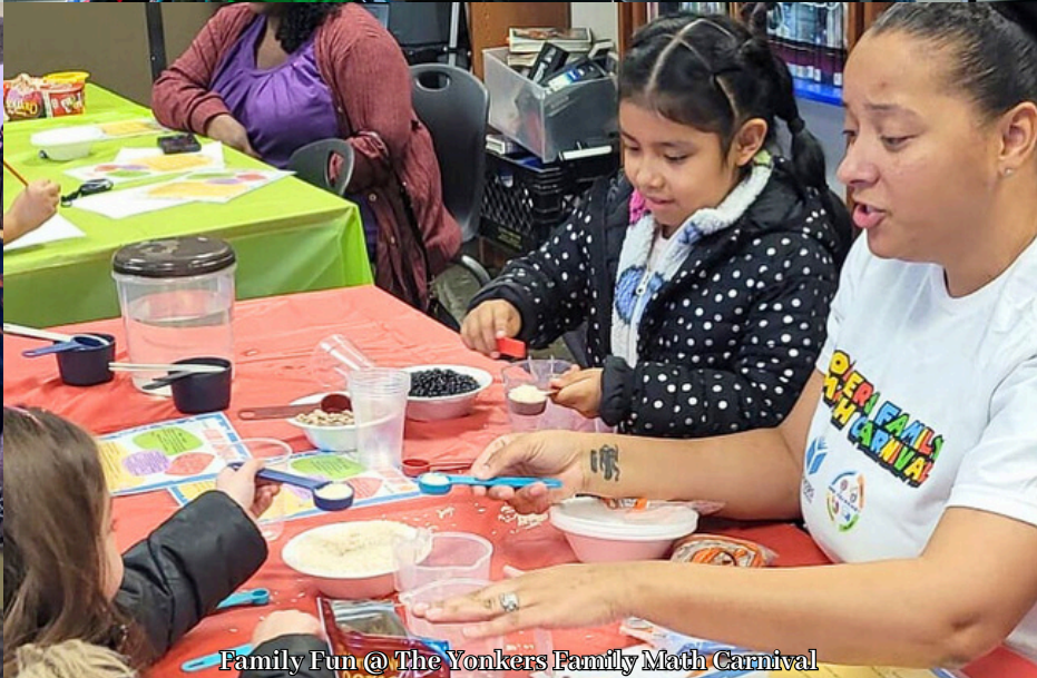
Family Fun @ The Yonkers Family Math Carnival