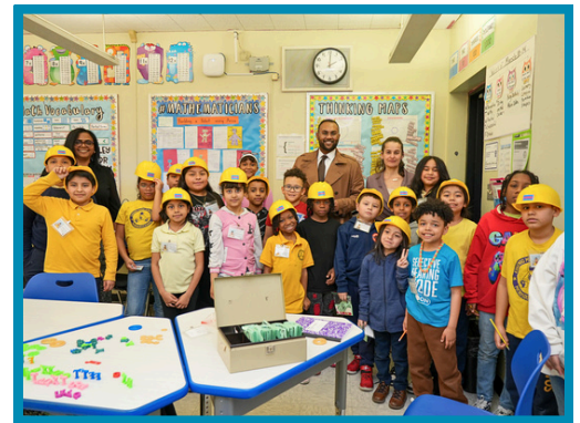
Eugenio María de Hostos MicroSociety School Students in Action

I also had the opportunity to participate in this week's Yonkers Board of Education Policy and Instructional Affairs Committee meeting, as well as the Facilities and Audit Finance Workshop. These meetings allow us to focus on ensuring our schools are operating effectively and efficiently while advocating for the resources our students and staff need.