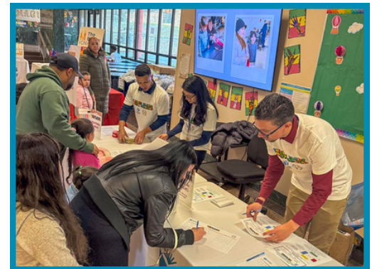
Students and Families Came Out This Wednesday to Enjoy the Fun-Filled Yonkers Family Math Carnival

I checked out the Family Math Carnival at Boyce Thompson School – a packed house, full of energy, laughter, and a whole lot of math!