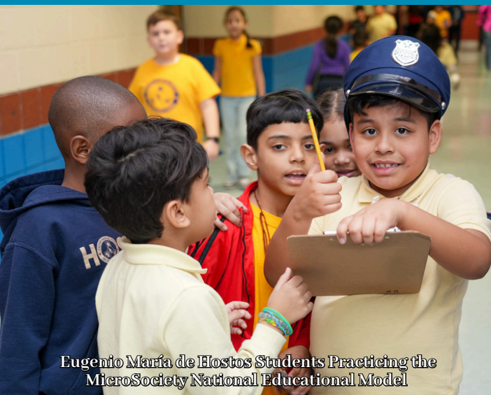
Eugenio María de Hostos Students Practicing the MicroSociety National Educational Model