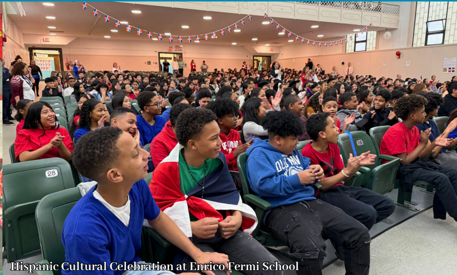
Hispanic Cultural Celebration at Enrico Fermi School