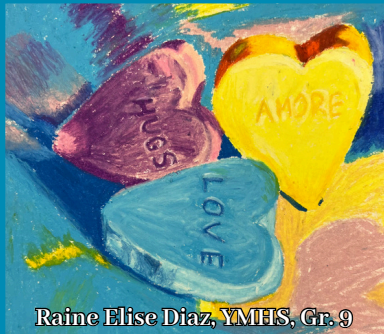
Raine Elise Diaz, YMHS, Gr. 9