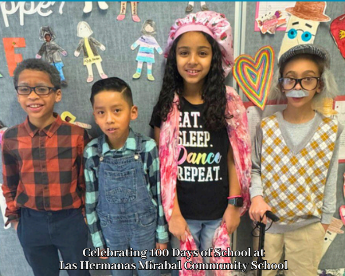
Celebrating 100 Days of School at Las Hermanas Mirabal Community School