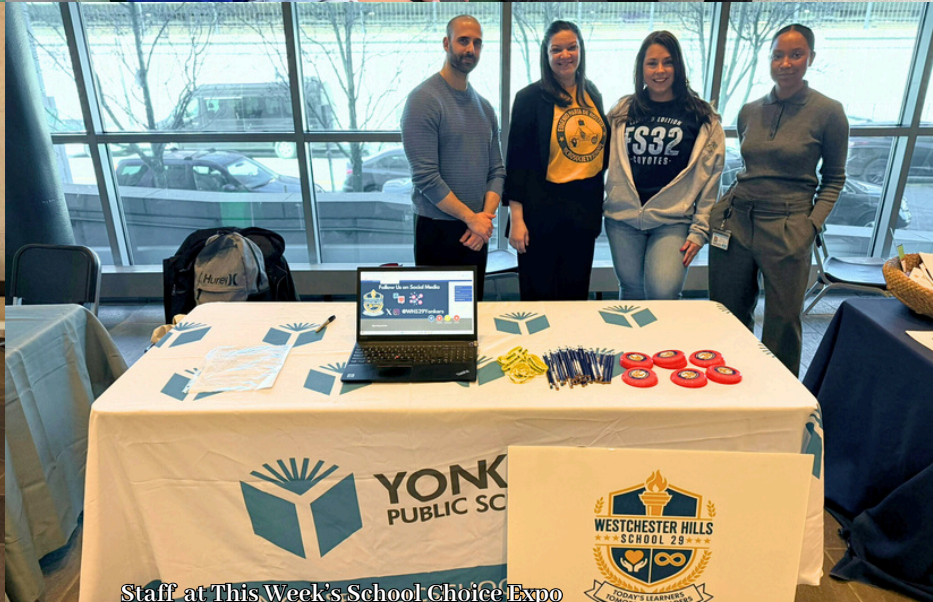
Staff at This Week's School Choice Expo