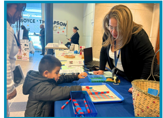
Learning in Action at This Week's School Choice Expo

This week, the Yonkers Board of Education made the difficult but necessary decision to close Museum School 25 at the end of this school year. Decisions like these are never easy, but as we right-size our district, we must ensure that enrollment aligns with vacancies and that our resources are used effectively to provide the best possible education for all students.