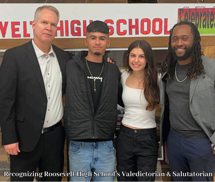
Recognizing Roosevelt High School's Valedictorian & Salutatorian