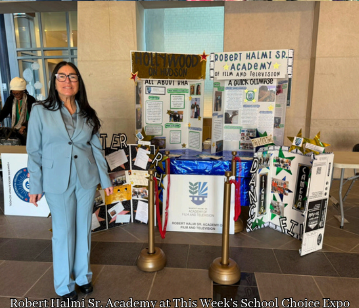
Robert Halmi Sr. Academy at This Week's School Choice Expo