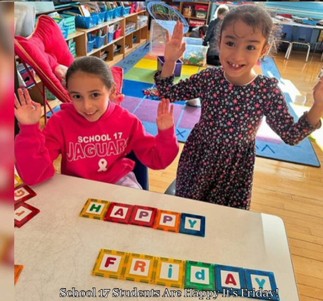
School 17 Students Are Happy It's Friday!