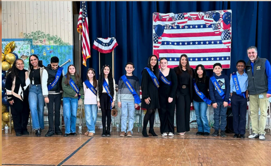
Family School 32 Student Government Inauguration