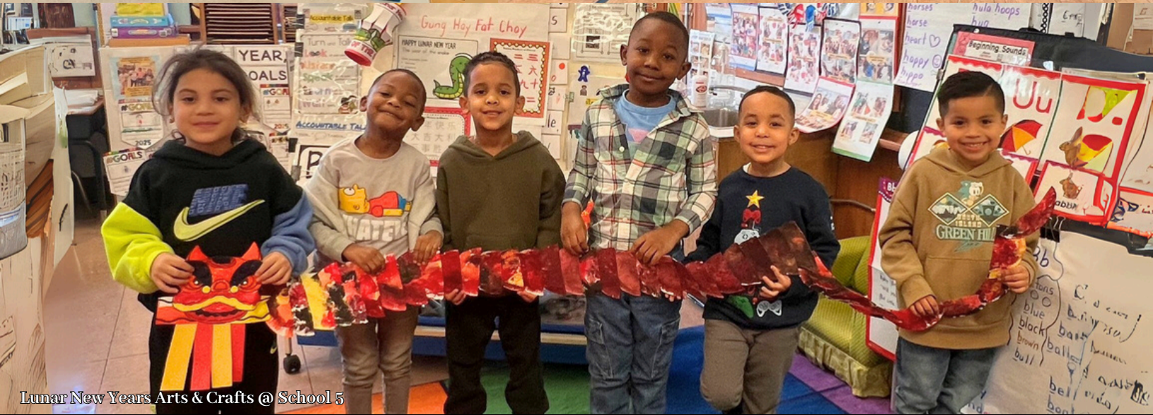
Lunar New Years Arts & Crafts @ School 5