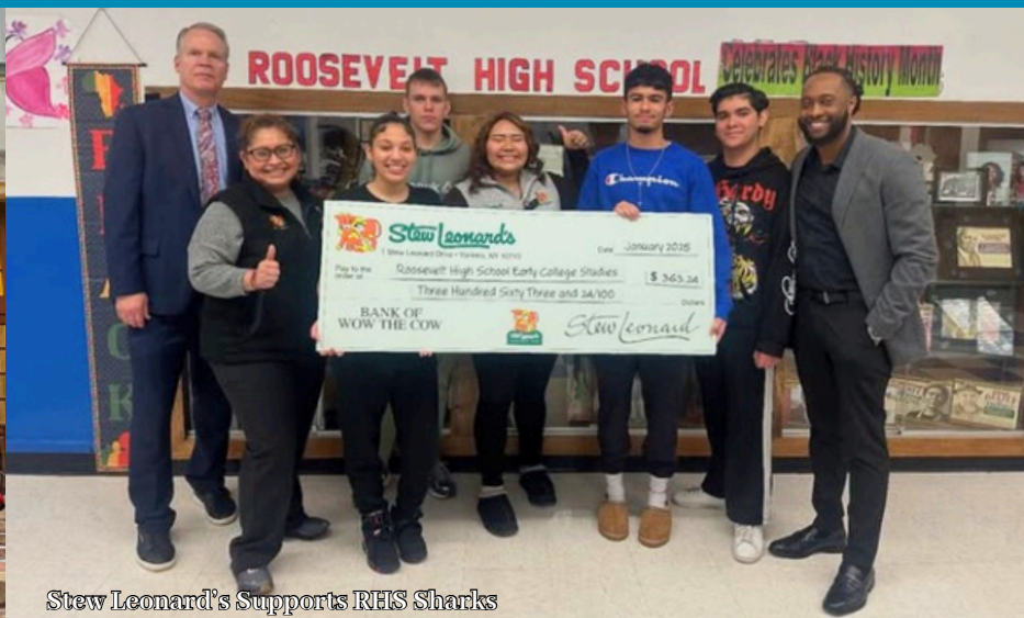
Stew Leonard's Supports RHS Sharks