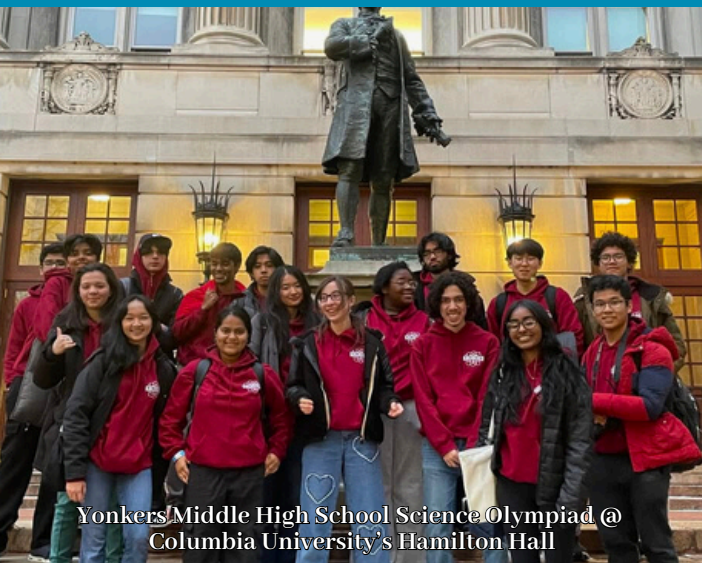
Yonkers Middle High School Science Olympiad @ Columbia University's Hamilton Hall