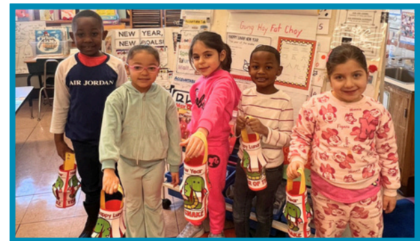
Students at School 5 Made Lanterns to Celebrate the Lunar New Year

In addition, I had the opportunity to strengthen our partnerships with NAACP Yonkers and Yonkers Partners in Education (YPIE), two organizations dedicated to providing invaluable resources and support to our students and families. Collaborating with these groups help expand opportunities for our students and ensure they have the support systems they need to thrive.