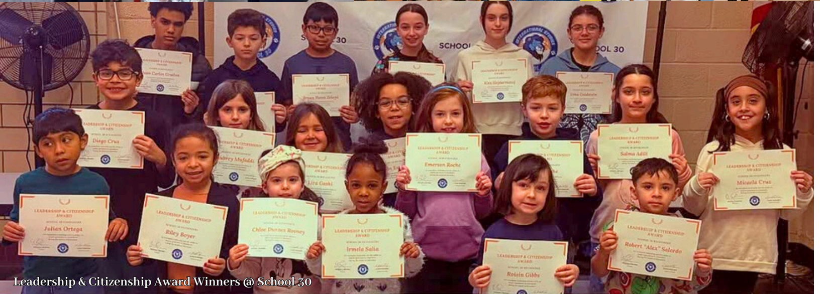
Leadership & Citizenship Award Winners @ School 30