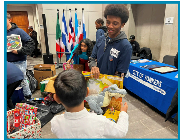
MBK Student Volunteers Spread Joy in the Community by Distributing Gifts During This Week's Three Kings Day Celebration