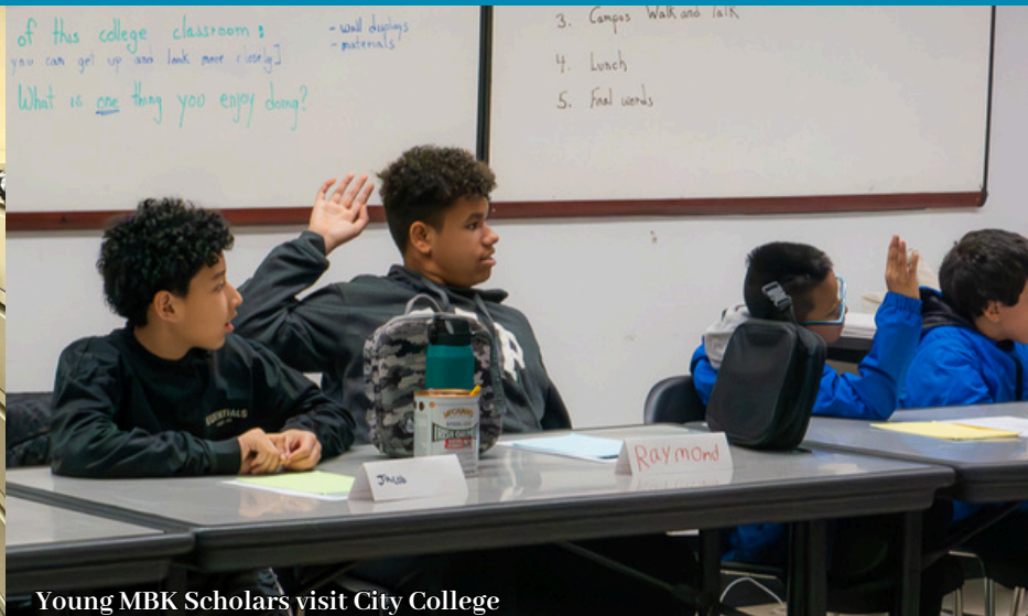
Young MBK Scholars visit City College