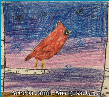
Areeba Jamil, Siragusa, Gr. 3