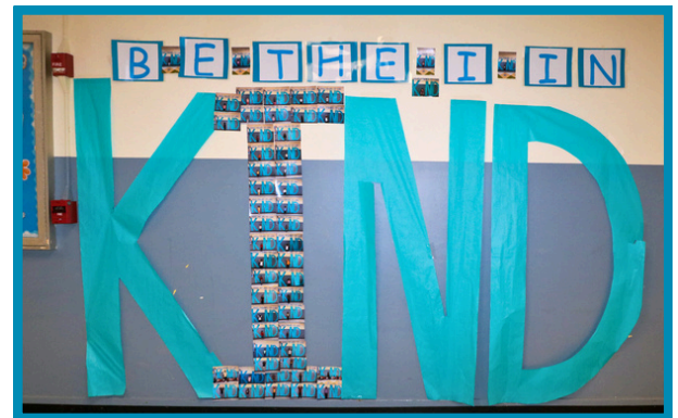
PEARLS Hawthorne School is Spreading Kindness & Yonkers Magic

Today marks the end of the first full week after the holiday break and the Yonkers Magic was on full display! It was a week filled with meaningful conversations, celebrations of our community, and important work to strengthen our schools as we kick off 2025 with purpose.