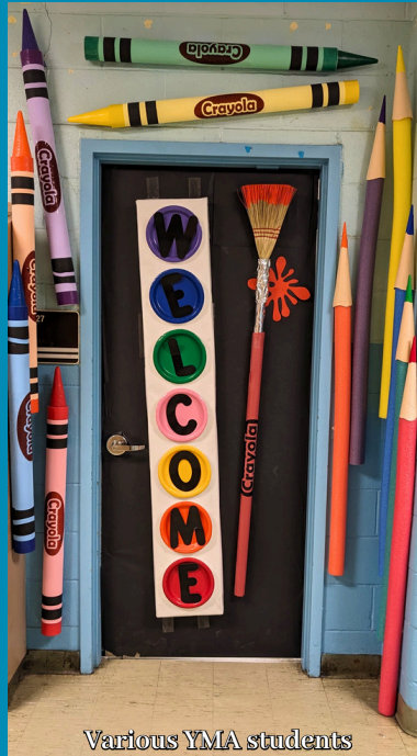
Various YMA students