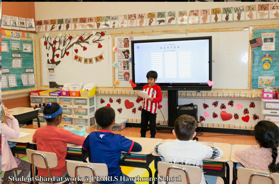
Students hard at work @ PEARLS Hawthorne School