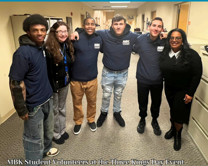
MBK Student Volunteers at the Three Kings Day Event