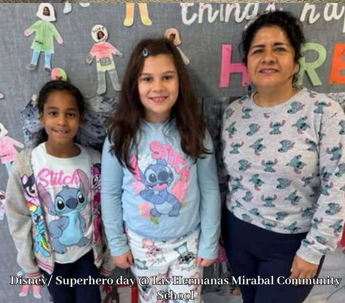
Disney/ Superhero day @ Las Hermanas Mirabal Community School