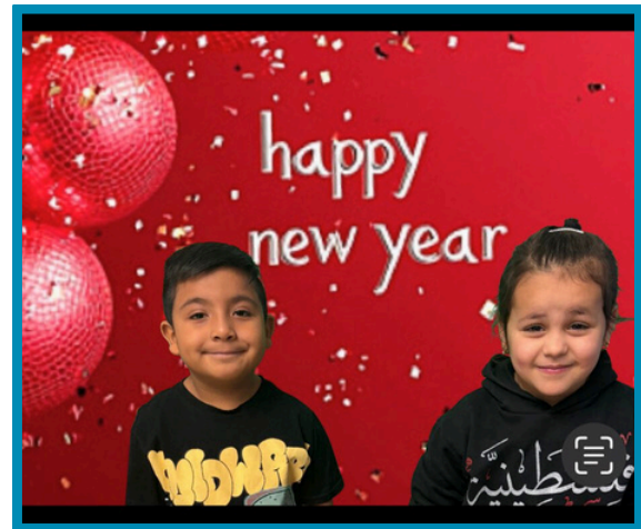
Las Hermanas Mirabal Community School Students Are Ready to Take On 2025!